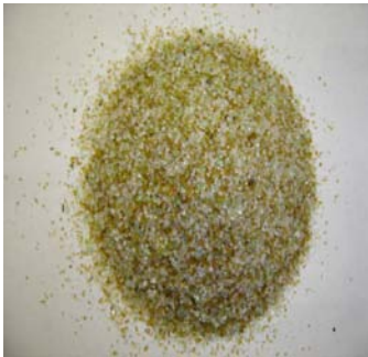
#1 – 10/30 Mesh

The ONLY abrasive specifically designed for outdoor use that is both ENVIRONMENTALLY-FRIENDLY and poses NO HEALTH HAZARDS to the operator!