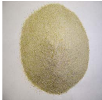
#3 – 50/80 Mesh